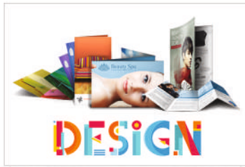
Advertising & Brand Management

at starting package of 2 - 4 lacs per annum after training from Camford Institute