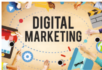
Digital Marketing Strategies