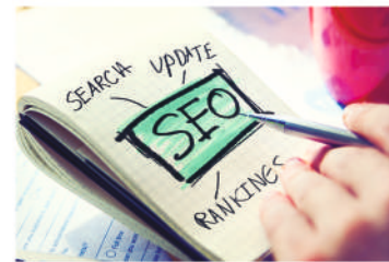
Search Engine Optimization

You'll learn what digital marketing is about, including understanding the buzz words and main trends. It also looks at digital metrics, regulation and codes of practice. The modules offered will equip you with 'state-of-the-art' know-how of internet marketing, with hands-on industry based exercises and assignments throughout the course. Elements of business and enterprise applications give the participants additional values.