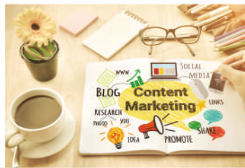
Content Development Strategies