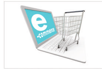
Introduction to E-commerce