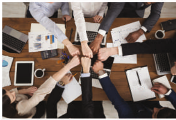
Principles of Marketing