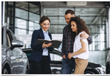
Global Luxury Brand Strategy

The MBA Marketing and Luxury Brand Management at the Camford Institute of Management builds on our expertise in the luxury industry. We developed this innovative programme to meet the growing demand for experienced managers who really understand luxury brand management in a global context.