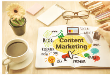
Luxury Marketing and Marketing Trends