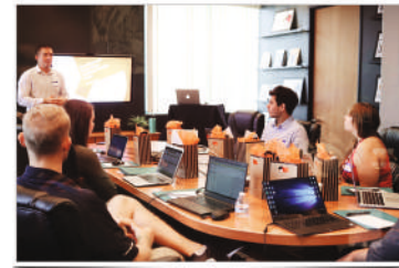
Quantitative Research Approaches