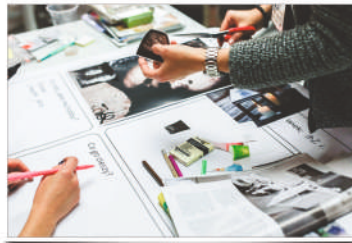
Design Thinking and Brand Strategy