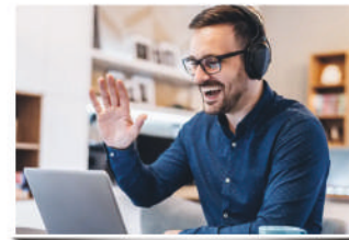
Hospitality & Tourism