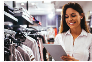
Small & Medium Business

This training program gives you an exhaustive understanding of all the HR subjects through theoretical and practical sessions by our very own industry experts. Our programs pave the way for you to learn your way to the top.