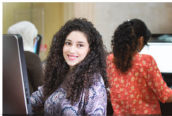
Information Technology for Management