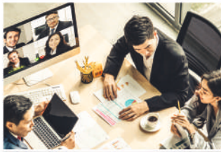
Education & Training