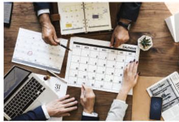
Human Resource Management