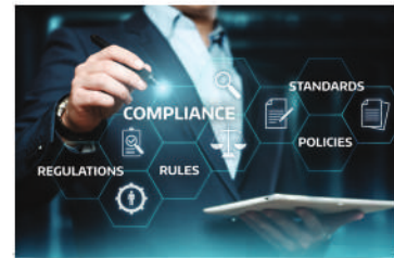
Pay-Roll and Labor Law

Students learn the relevant human resource management principles, skills and knowledge through innovative teaching and learning methodologies. With this, students are not only able to perform effectively and efficiently within a variety of contemporary business environments, but are also properly equipped to face the numerous dynamic challenges in local and global industries.