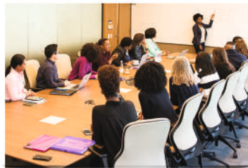
Training and Development Strategy