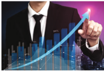
Principles of Management