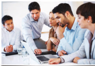
Corporates & MNCs

The HR training program gives the learners the confidence they have always craved for mastering the skills.