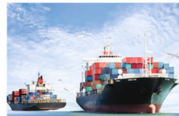
Air Cargo, Shipping Cargo and Transport Management