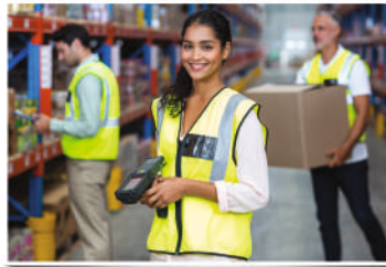
Warehouse Operation and Distribution Management