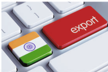
Import and Export Documents & Documentation