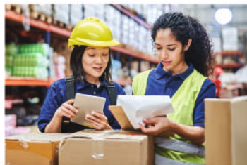
Material Handling Packing and Containerisation