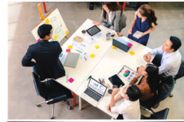
Procurement and Outsourcing