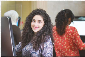
Information Technology for Management