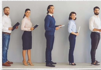
Manpower Planning, Recruitment and Selection