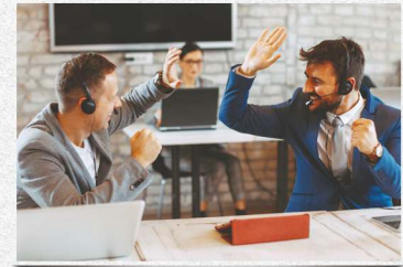
Performance Management System