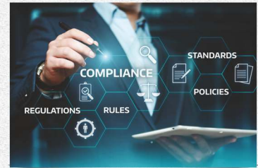
Industrial Relations & Labor Laws

The course is organized in a manner so as to channelize knowledge and skills in regards to application of human resource principles and techniques in business to the students in the respective field. This is done in accordance with the aim of preparing them effectively for the challenges in the practical domain.