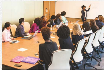
Training and Development Strategy