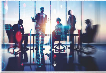
HR Management Theory and Practice