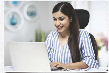
Material Management, Medical Records & Insurance