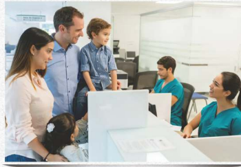
Patient Relationship Management