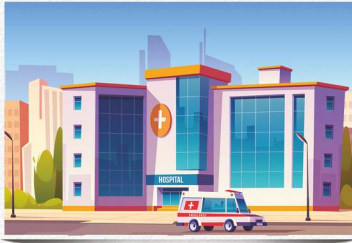
Fundamentals of Hospital Administration