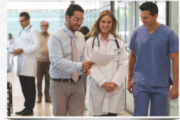
Hospital Organization Structure and Function