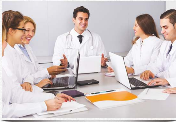
Management & Professional Business Skills