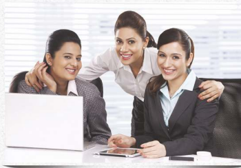
Human Resource Management for Hospital