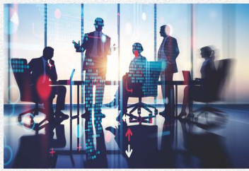
Management Theory and Practice