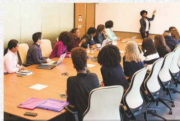
Training and Development Strategy