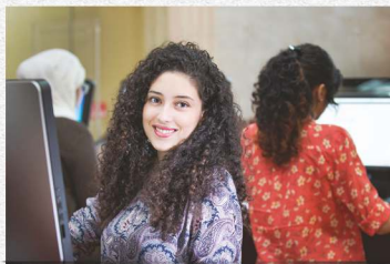
Information Technology for Management