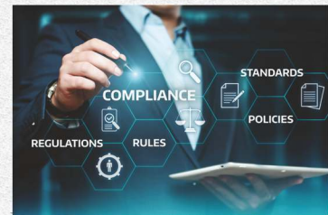
Industrial Relations & Labor Laws

The course is organized in a manner so as to channelize knowledge and skills in regards to application of human resource principles and techniques in business to the students in the respective field. This is done in accordance with the aim of preparing them effectively for the challenges in the practical domain.