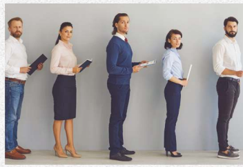
Manpower Planning, Recruitment and Selection