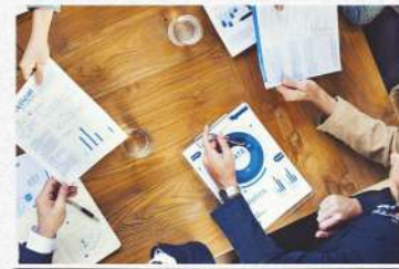
Customs Clearance & Import - Export Procedures