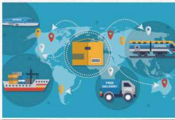
Logistics Operations & Supply Chain Management