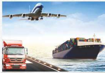
Shipping - Air Cargo & Transportation Management