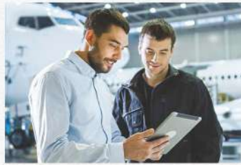
Marketing Management & Enterprise Resource Planning