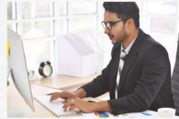
Documentation & Business Administration