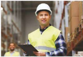
Warehouse, Inventory & Distribution Management