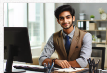
HUMAN RESOURCE MANAGEMENT