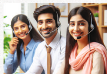
MARKETING - SALES & BUSINESS PROMOTION