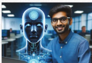
BUSINESS AUTOMATION & COMPUTER APPLICATION