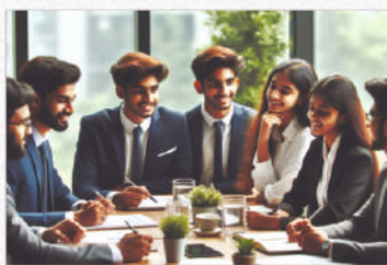
ENTREPRENEURSHIP / STARTUP MANAGEMENT