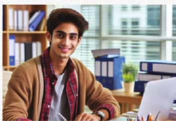
ACCOUNTING AND FINANCE MANAGEMENT