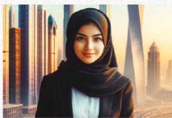
DATA ANALYTICS & BUSINESS ANALYTICS